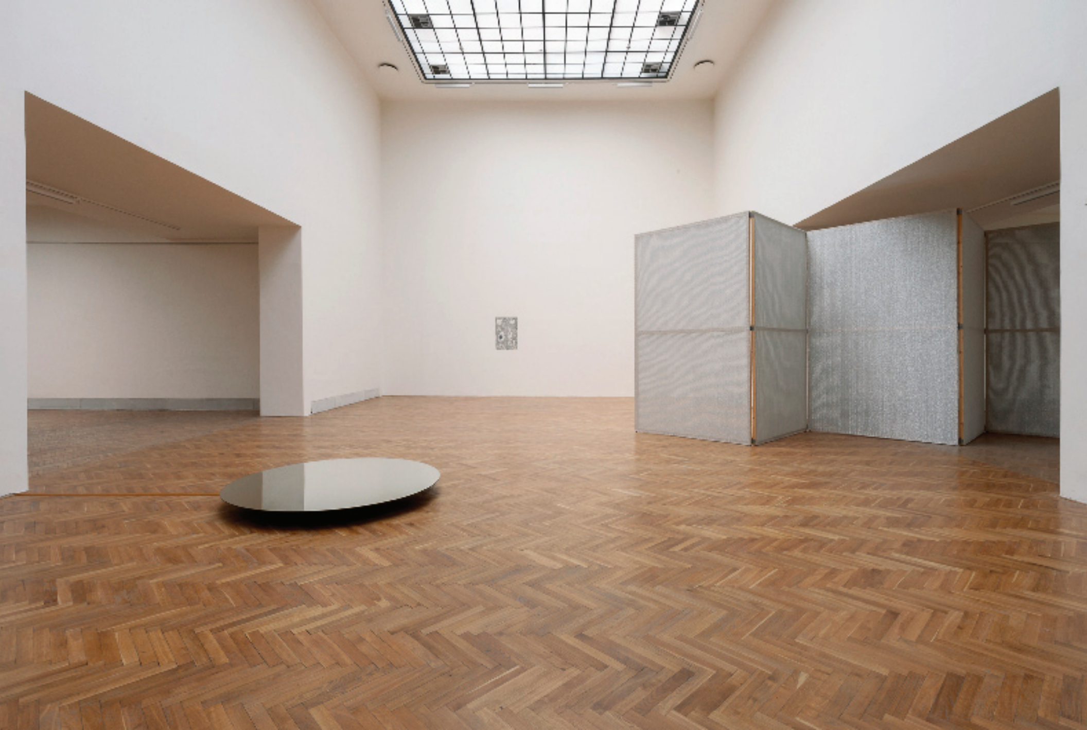
Rotating Circular Mirror, Installation view "The Art of Diminished Difference" The Brno House of Arts, 2020 (Karin Sander, wall Piece, 2020, Heimo Zobernig, Stage Mesh Paravan, 2020)