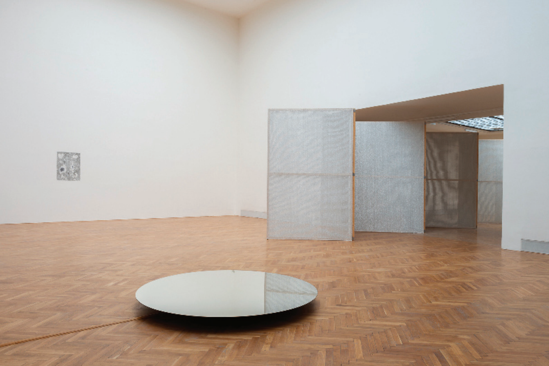
Rotating Circular Mirror, 200 cm diameter mirror, electric motor, 2012-2020