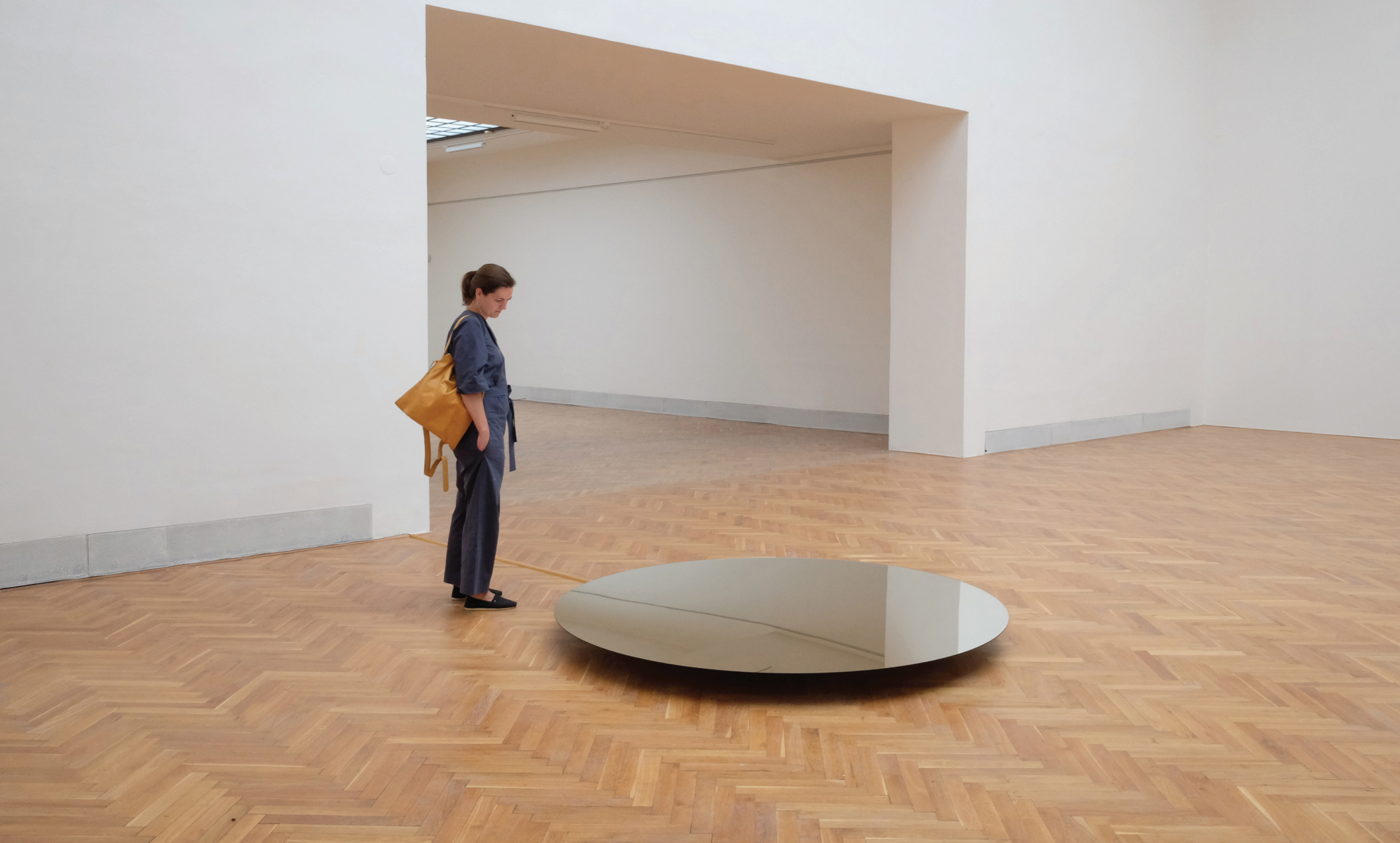
Rotating Circular Mirror, 200 cm diameter mirror, electric motor, 2012-2020